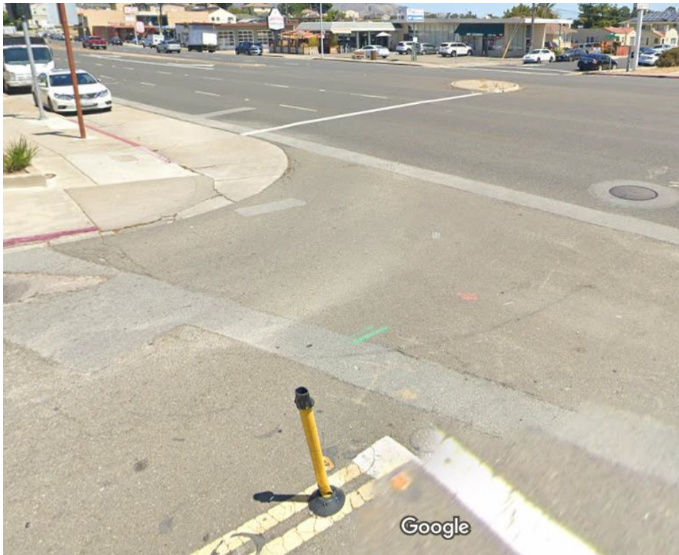
Figure 1: View of El Camino Real from Santa Lucia